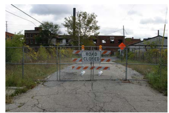
The old Columbus Coated Fabrics site along the eastern edge of Weinland Park in 2006.

In 2003, Ohio Capital Corporation for Housing (OCCH), a statewide nonprofit financier of affordable housing, formally acquired the housing portfolio. OCCH established Community Properties of Ohio (CPO) to provide non-profit ownership and effective management. Between 2004 and 2009, OCCH invested more than $30 million in the renovation of these apartments, which offer housing with affordable rents for the lowest-income families.