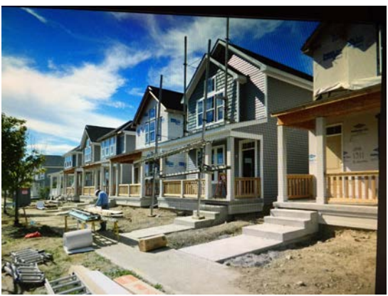
New house construction in 2015 on remediated Columbus Coated Fabrics site.

With the prospect for renewal in Weinland Park, the city in 2004 launched a community-based planning effort to develop the Weinland Park Neighborhood Plan . As adopted by city council in 2006, the plan provides the blueprint for the physical rehabilitation of the neighborhood with its primary goal of creating a mixed-income community.