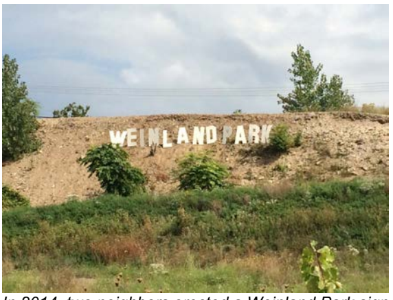
In 2014, two neighbors erected a Weinland Park sign on the large mound of dirt on a portion of the former Columbus Coated Fabrics side, bringing a touch of humor to the neighborhood work.