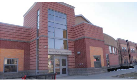
Weinland Park Elementary School, which opened in 2007, is an example of public investment in Weinland Park.