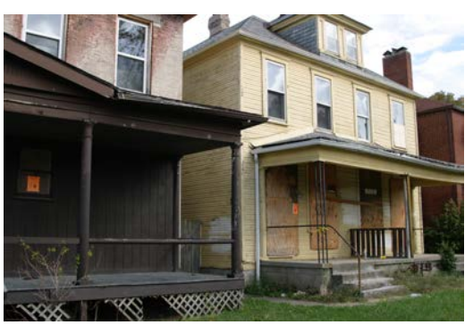
Example of boarded-up housing in Weinland Park at the beginning of the WPC's work.