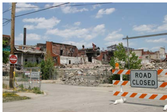
Demolition of the Columbus Coated Fabrics buildings in 2007.